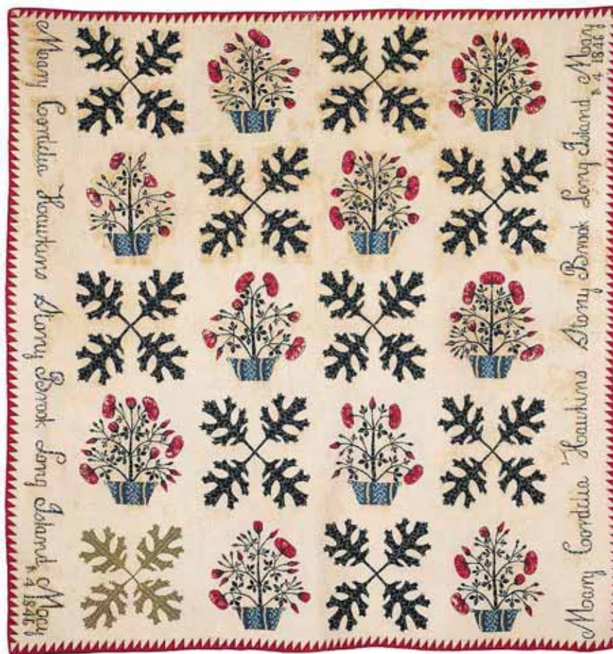
newsday.com NEWSDAY, SUNDAY, APRIL 10, 2022