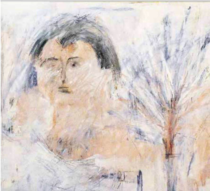
LONG ISLAND MUSEUM