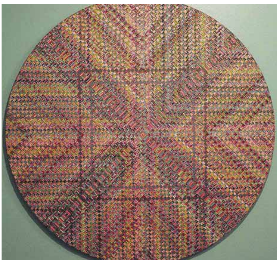
HECKSCHER MUSEUM OF ART