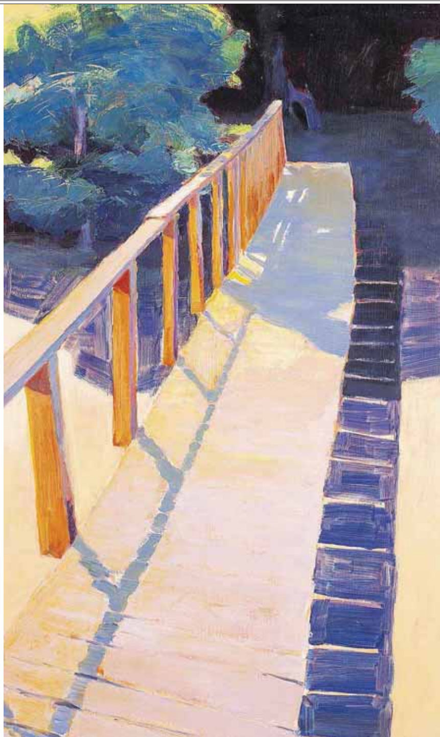
LONG ISLAND MUSEUM