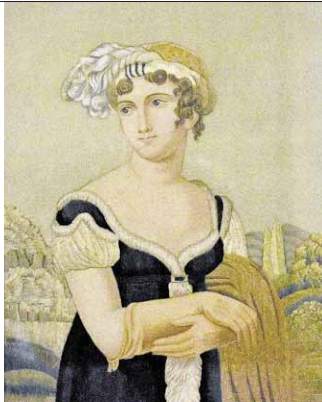
LONG ISLAND MUSEUM